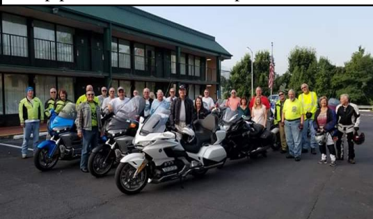
Group picture of GWRRA chapters and Retreads